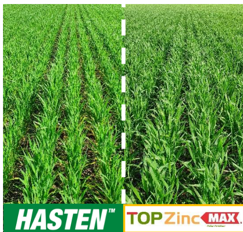
Figure 1: Visual canopy differences following an early-season Velocity® (670 mL/ha) application.

TOPZinc Max is a unique phytostimulant that is suitable for application on all crops. Exhibiting a comprehensive formulation allows the product to perform without the addition of a pesticide additive. Ideally suited as a spray tank partner for post-emergent herbicides, such as Velocity® and Intervix®, the recommended application timing is during the early vegetative phase.