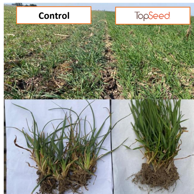
Figure 1: Wheat biomass and vigor for seed treatment. Left Control, and right: with TOPSEED. Trial conducted in Pergamino, Buenos Aires (2020).